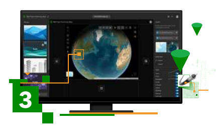
Configure and share web apps for project and operational workflows.