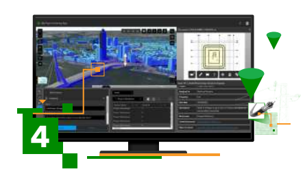
Inform stakeholders on progress and analysis, and inject feedback.